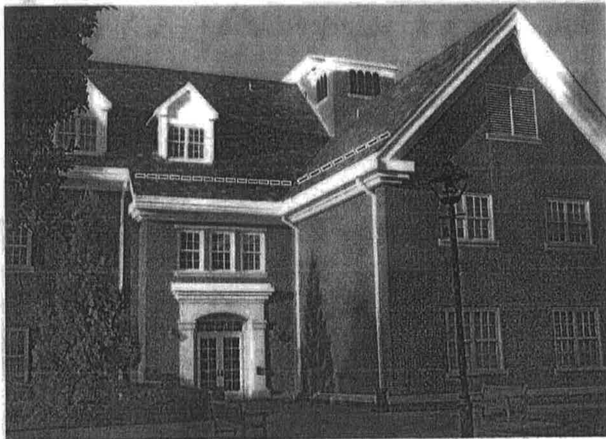
Approximate East & West Snow Rail locations