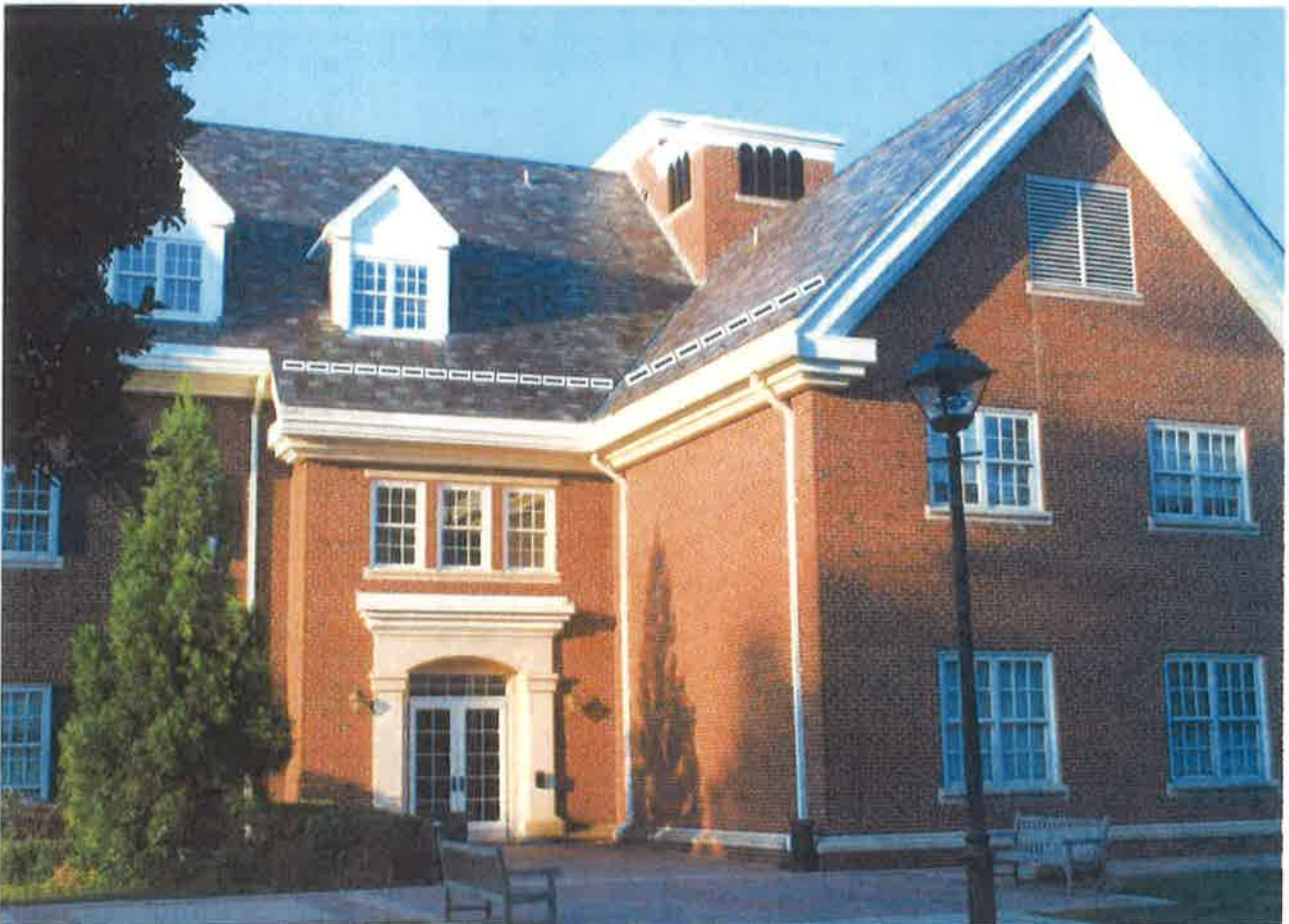
Approximate East & West Snow Rail locations